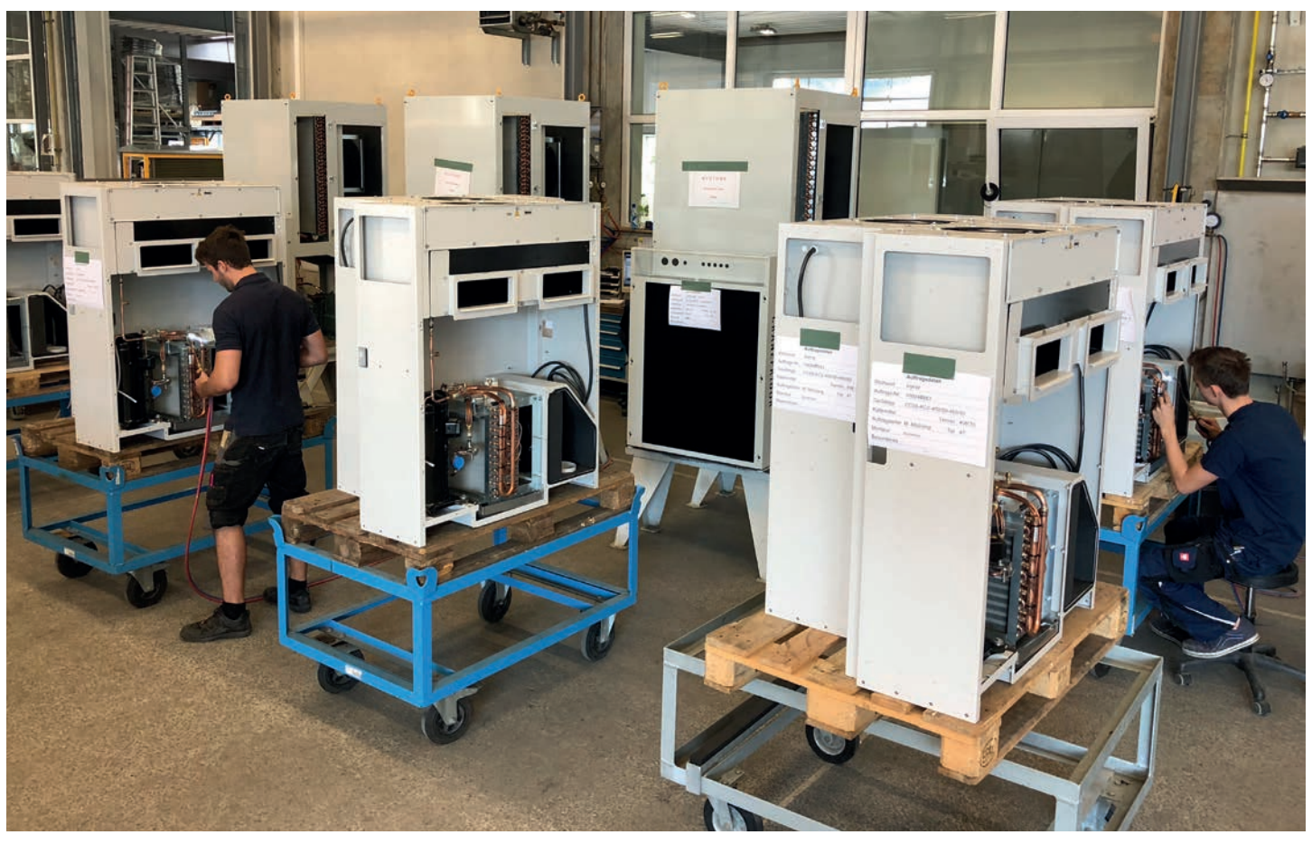
In the main plant in Amtzell, Germany all products made by FrigorTec GmbH are developed, constructed and produced. Every device passes a quality inspection with test runs before delivery. FrigorTec solutions are sold in over 84 countries through our worldwide distribution network.