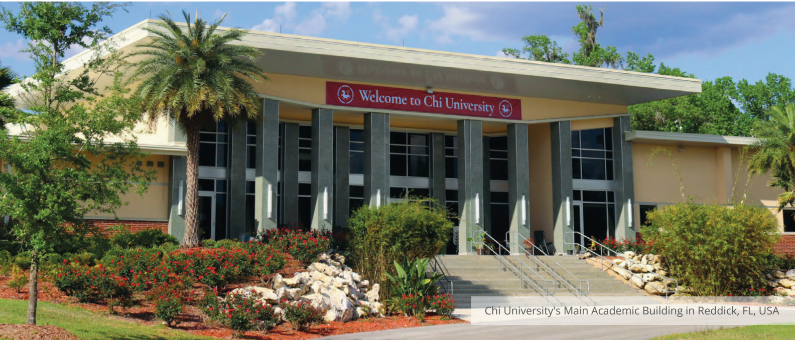
Chi University's Main Academic Building in Reddick, FL, USA