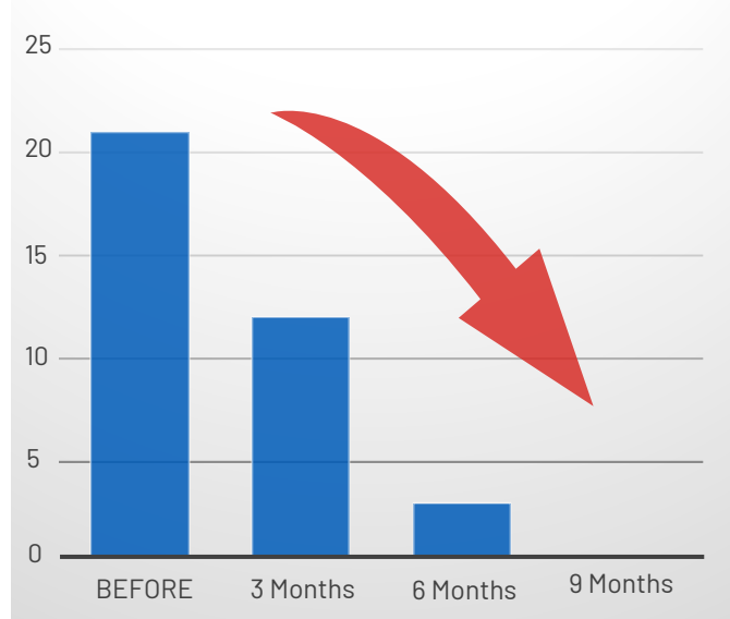
Customer Complaints per Month

After installing Valco Melton's WindowChek system on the Heiber+Schröder window machine and the Bobst EXPERTFOLD with GenieCut, they significantly reduced defective products from shipping to customers.