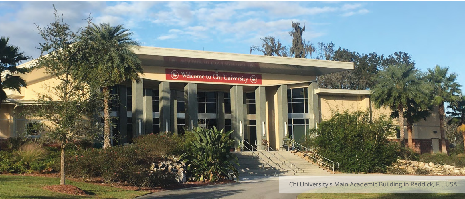
Chi University's Main Academic Building in Reddick, FL, USA