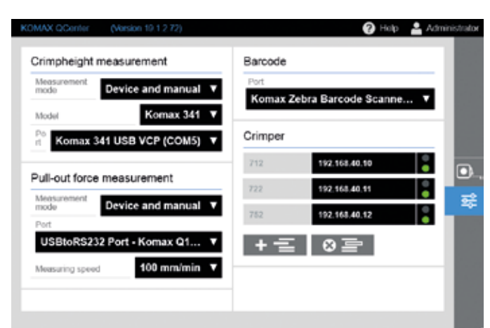
Uniform display with simple control elements.