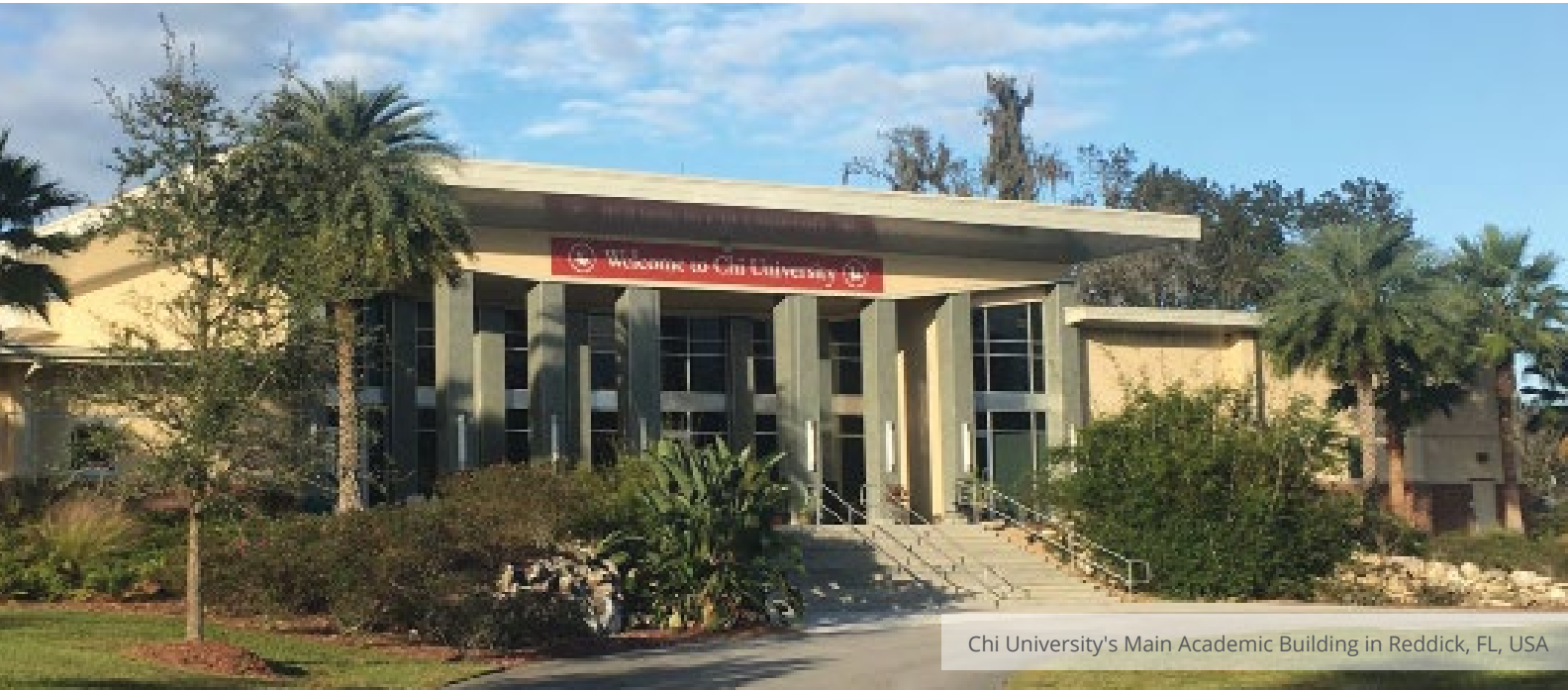
Chi University's Main Academic Building in Reddick, FL, USA