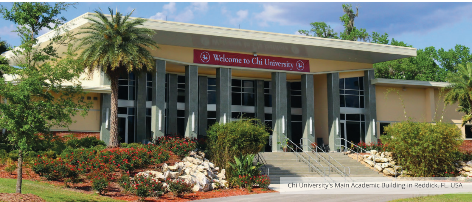
Chi University's Main Academic Building in Reddick, FL, USA