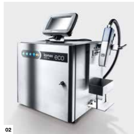
01 User-friendly operation with color touch panel 02 A practical cleaning station is available in the range of accessories

Thanks to modern manufacturing processes, the angular print head makes it an attractive option.