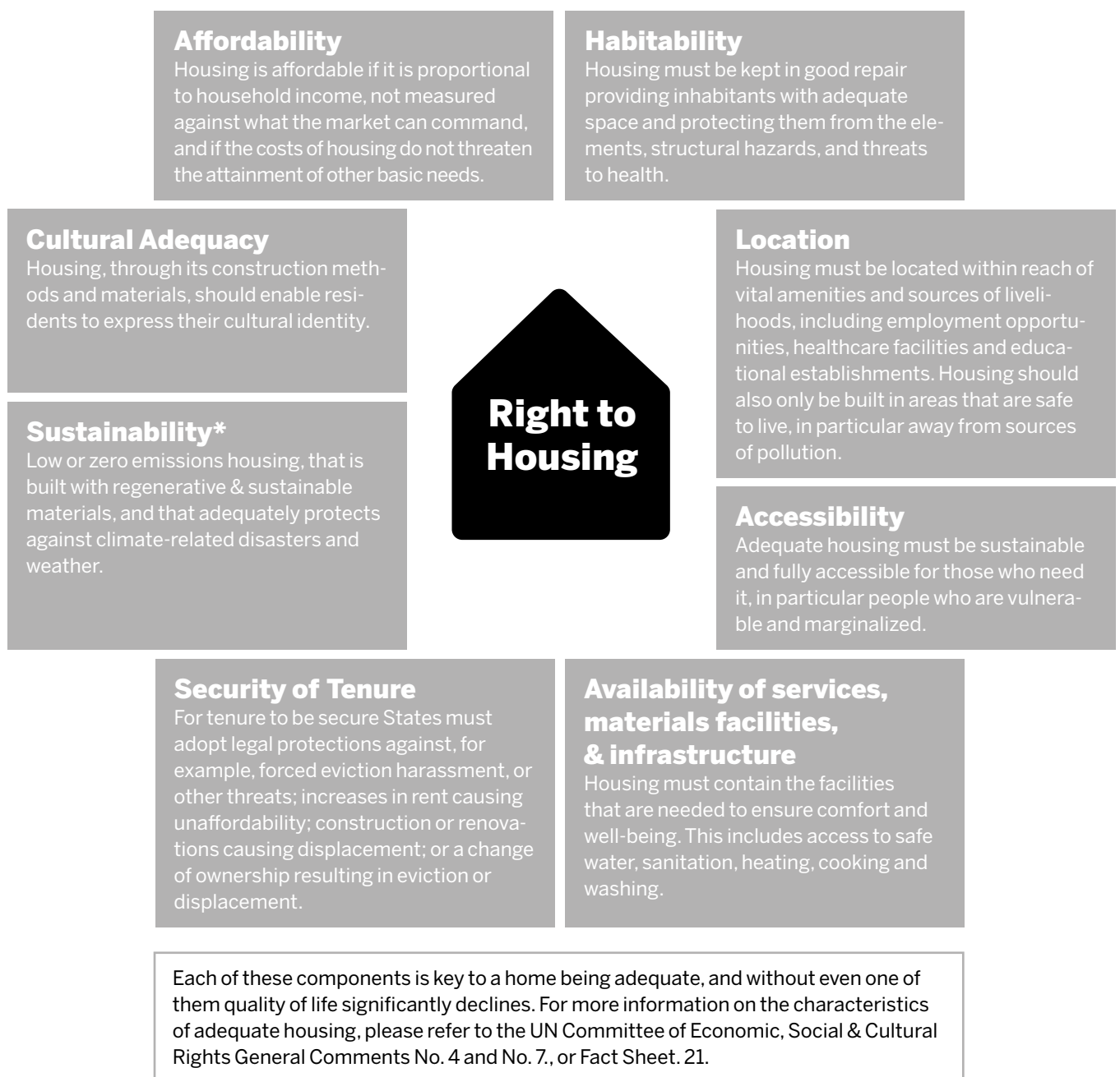
Figure 1. Characteristics of the right to housing

There is an international consensus that housing is a fundamental human right. It is found in the Universal Declaration of Human Rights (1948), in the International Covenant on Economic, Social and Cultural Rights, as well as other human rights treaties ratified by almost all national governments around the world. It is contained within Goal 11 of the Sustainable Development Goals (SDG), in the Paris Agreement, as well as in the New Urban Agenda. For housing to be considered adequate, it must have eight key characteristics, as seen in Figure 1.