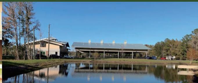
Chi University's Main Academic Building in Reddick, FL, USA