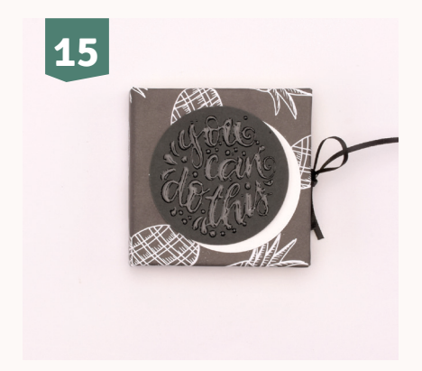
Punch another circle from white paper and glue the two circles slightly overlapping on the front cover.