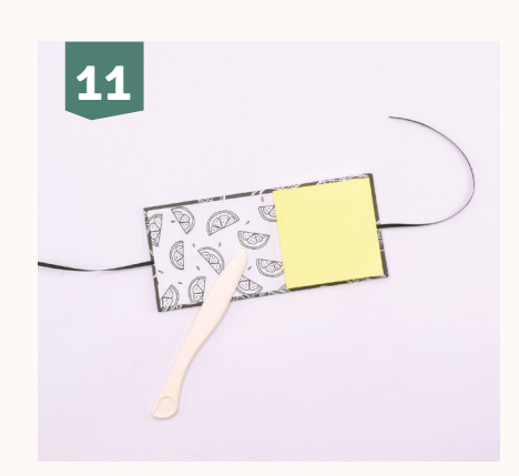
Glue this rectangle over the cardboard and ribbons, making sure to score the fold lines for a crisp finish. Then, attach a block of Post-Its.