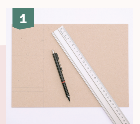
Take an A4 sheet of grey cardboard and draw two squares, each measuring 8 x 8 cm, and one rectangle of 1 x 8 cm.

Do you often find yourself jotting down notes on a Post-It? Keep your Post-It pad protected with a beautiful handmade cover. In this DIY project, we'll use scrapbook paper and clear stamps from Paperfuel. In just 15 steps, you'll create a small booklet that's not only practical to carry around but also makes a thoughtful gift!