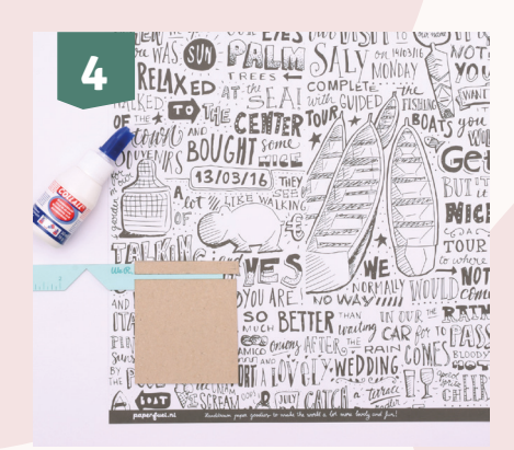
Rotate the Book Cover Guide 90 degrees and use the narrow section to align and attach the 1 x 8 cm cardboard piece.