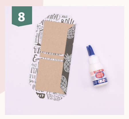
Fold all the paper flaps over and glue them down securely.