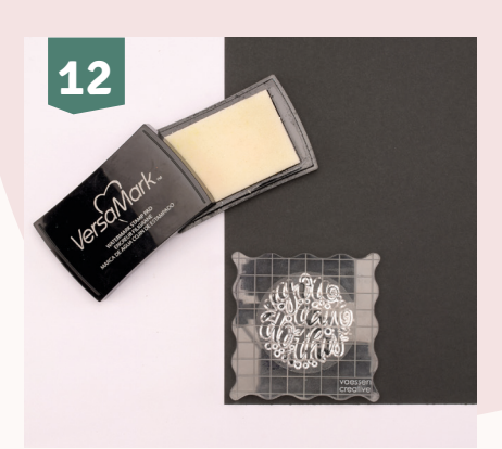
Grab a black sheet of cardstock and stamp a fun message on it using Versamark ink.