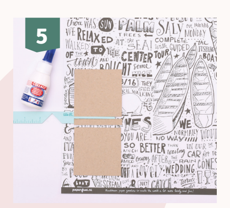
Repeat this process for the remaining piece of cardboard.