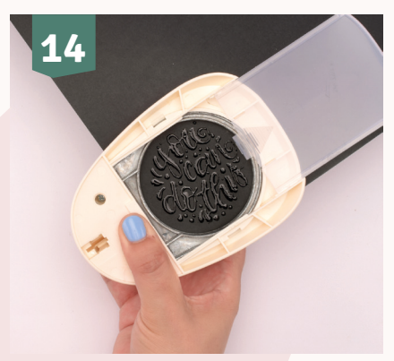
Use a circle punch to cut the text out precisely in the centre of a circle.