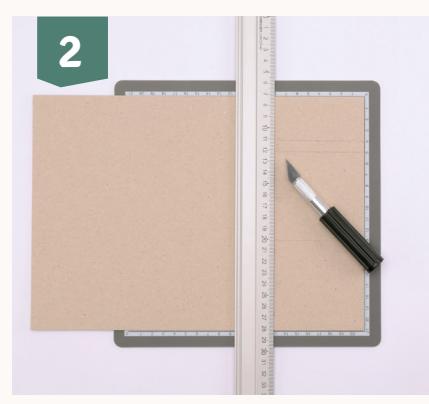
Place the cardboard on a cutting mat and use an aluminium ruler and craft knife to cut out the shapes.