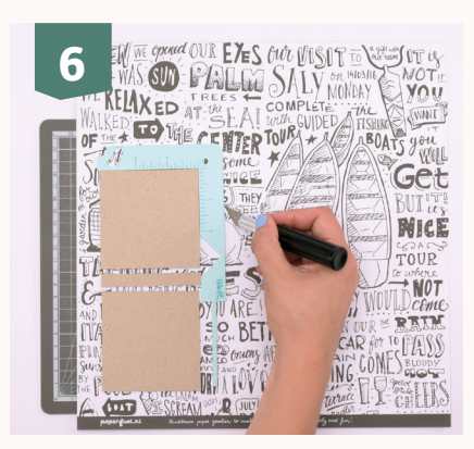
Next, place the Book Cover Guide at a right angle to each corner and trim off any excess paper.