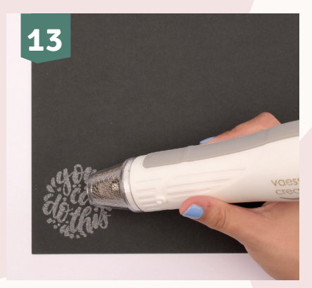
Sprinkle clear embossing powder over the stamped text and heat it with a heat tool until the powder turns fully transparent.