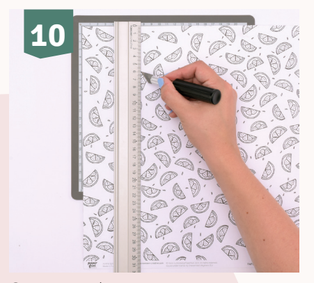
Cut a rectangle measuring 7.5 x 17.5 cm from another sheet of scrapbook paper.