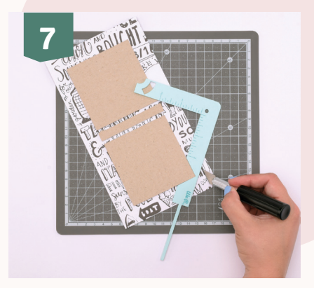
Use the Book Cover Guide's notches to cut the corners of the paper at an angle.