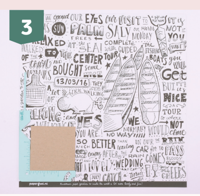
Take a sheet of scrapbook paper and align the We R Makers Book Cover Guide in a corner. Position one of the 8 x 8 cm cardboard squares on top and secure it with bookbinding glue.