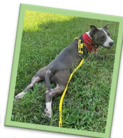
Franklin, 90 days