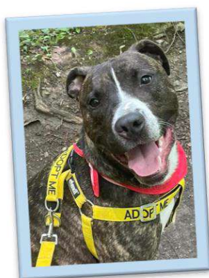
Longest stay pup Dusty 228 days!

At least 6 met their adopters! 4 volunteers adopted their DDO pups!