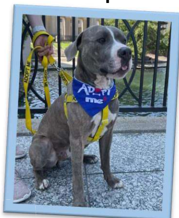
Pax, 60 days