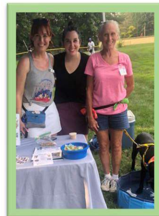
Volunteers at Opti-park