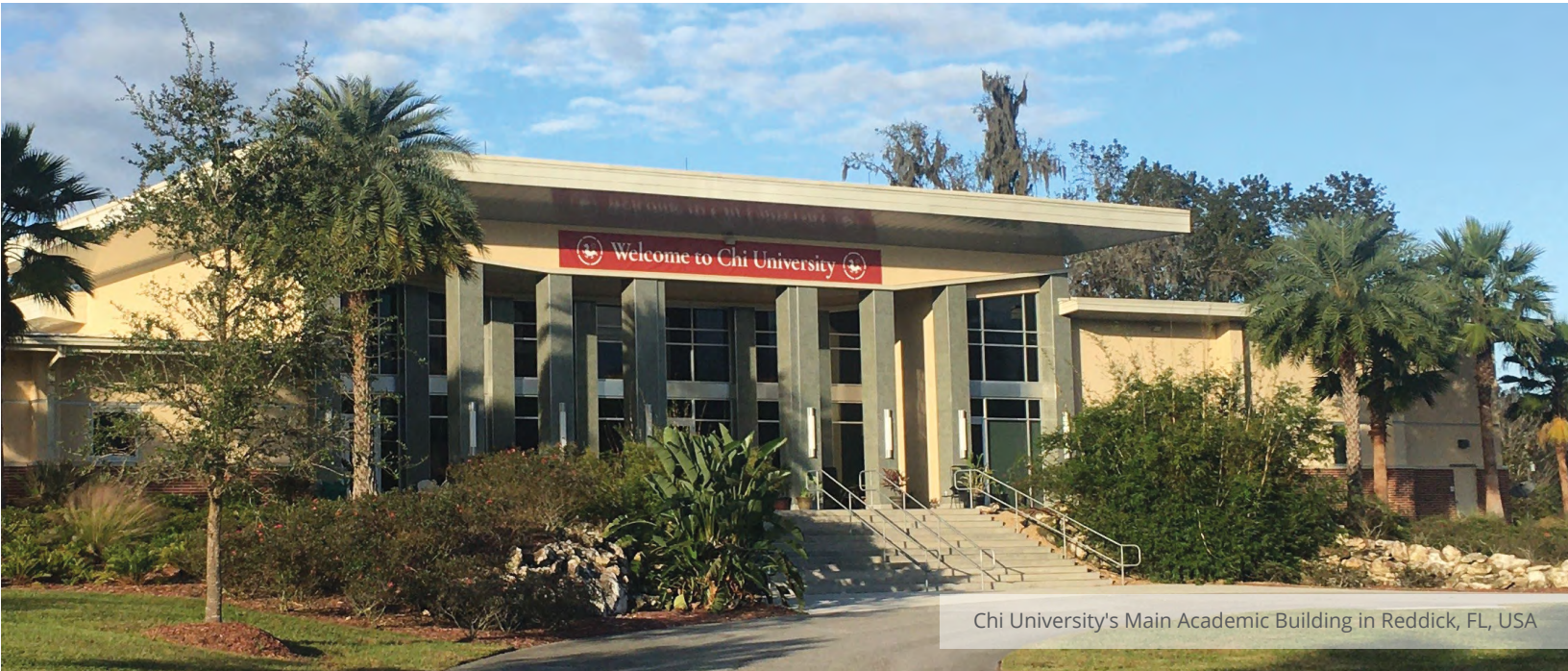
Chi University's Main Academic Building in Reddick, FL, USA