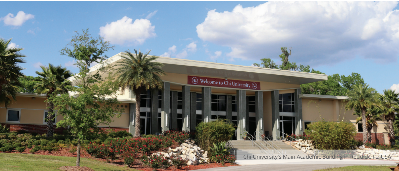
Chi University's Main Academic Building in Reddick, FL, USA