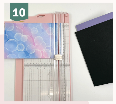
Transform the project into a card by taking a sheet of A4 cardstock in the colour hyacinth and score it to form an A5 card (14.8 x 21 cm). Then, cut a piece of black cardstock to 13.8 \times 20 cm and the sheet with the circles to 12.8 x 19 cm.