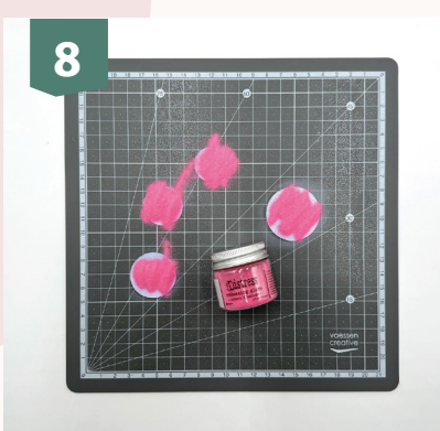
Sprinkle embossing powder over the still wet ink and shake off the excess powder.