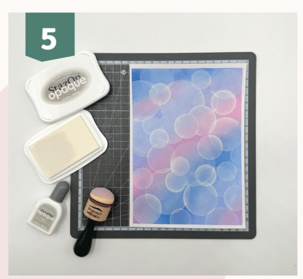
Continue making circles until you achieve the desired result.