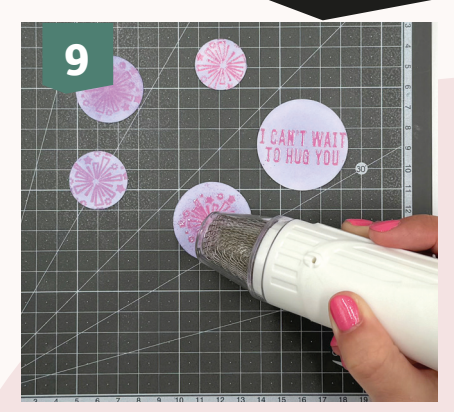
Heat the embossing powder using a heat tool until it becomes glossy.