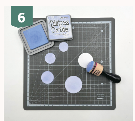
Use the remaining circles from step 3 and colour them with one of the Distress colours using a blending tool.