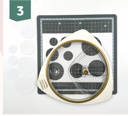
Create a stencil from another sheet of watercolour paper by cutting out circles of various sizes using a circle cutter. For example, maintain a half-centimetre difference in diameter between each circle. Keep the cut-out circles for later use.

Choose three colours of Distress Oxide ink and apply them to the damp paper using a blending tool. Use a separate foam pad for each colour. Make gentle, swirling motions to blend the colours seamlessly. Allow the paper to dry completely.