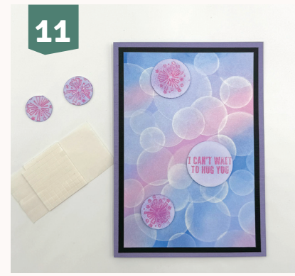
Attach the cut-out sheets to the base card using double-sided tape. Use 3D foam pads to adhere the circles to the card for an added depth effect.