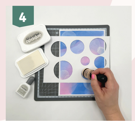
Utilise the homemade stencil with opaque ink and a blending tool. Create white circles by making swirling motions from the outer edge towards the centre. Ensure each circle is dry before proceeding to the next.