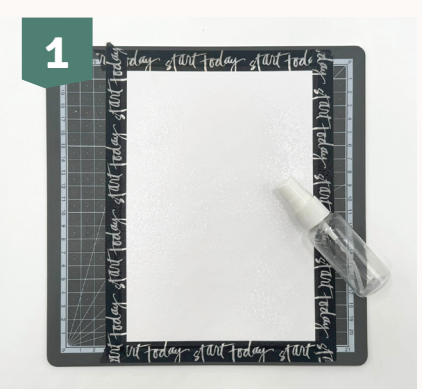
Take a sheet of smooth A5 watercolour paper, 300 grams, and secure it to a work surface with tape. Dampen the paper thoroughly using a spray bottle.

Bokeh, derived from the Japanese word 'boke' (blur), refers to the effect of blurred elements in a photograph. In this DIY, we recreate that photographic effect using paper and various inks. Explore depth and sharpness, and be amazed by the original outcome!