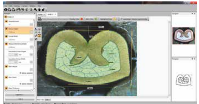
The most important measured variables can be measured fully automatic and manually as needed.