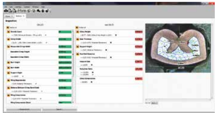
Specific additions can be made to the basic measurement functions (distance, area, counter, angle).

It greatly simplifies the measuring procedure for users. They are guided reliably and efficiently through the measuring procedure. The results are saved in a database and can be depicted and exported as a report.