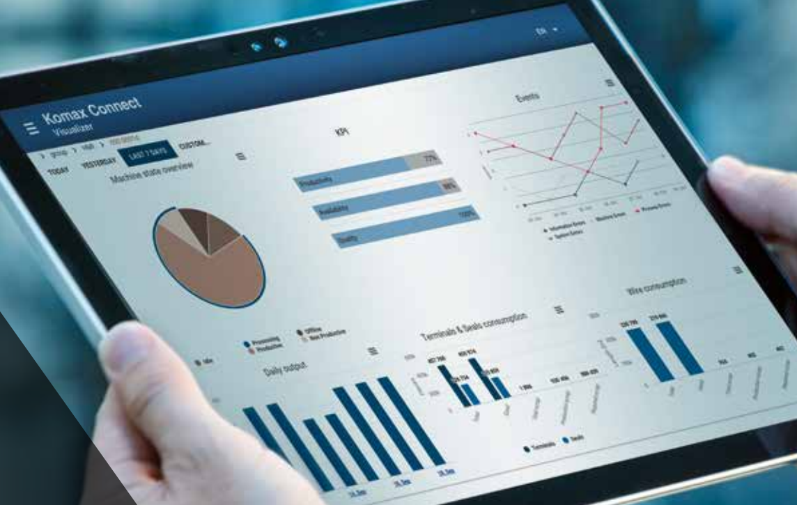
◀ Machine view The diagrams visualize the production data of a machine within a definable time frame.