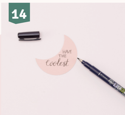
Write a refreshing message on the crescent with a brush pen or fine liner.