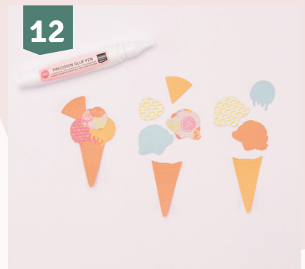
Assemble the ice creams as desired and stick them together.