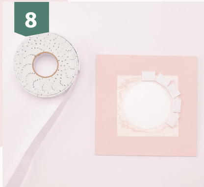
Turn the acetate sheet over and place 3D foam pads around the window, ensuring they are closely aligned with no gaps.