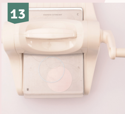
Take the circle from step 3 and use the smallest round die to create a crescent shape by placing it at an angle. Run it through the die-cutting machine.