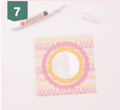
Attach both decorative edges to the front of the sheet with the acetate.