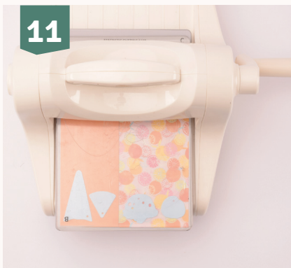
Die-cut the ice creams from various fun patterned papers using the ice cream dies.