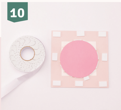
Take the circle saved from step 5 and place it with the lemon print facing the Shakables. Attach it. Add foam pads along the edges of the paper and affix the entire piece to the card base from step 2.