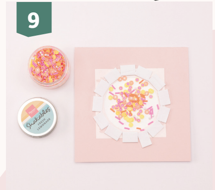
Sprinkle Shakables in the centre of the foam pads.