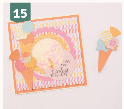
Attach the crescent and ice creams to the card. To add extra dimension, some ice creams can be adhered with foam tape.