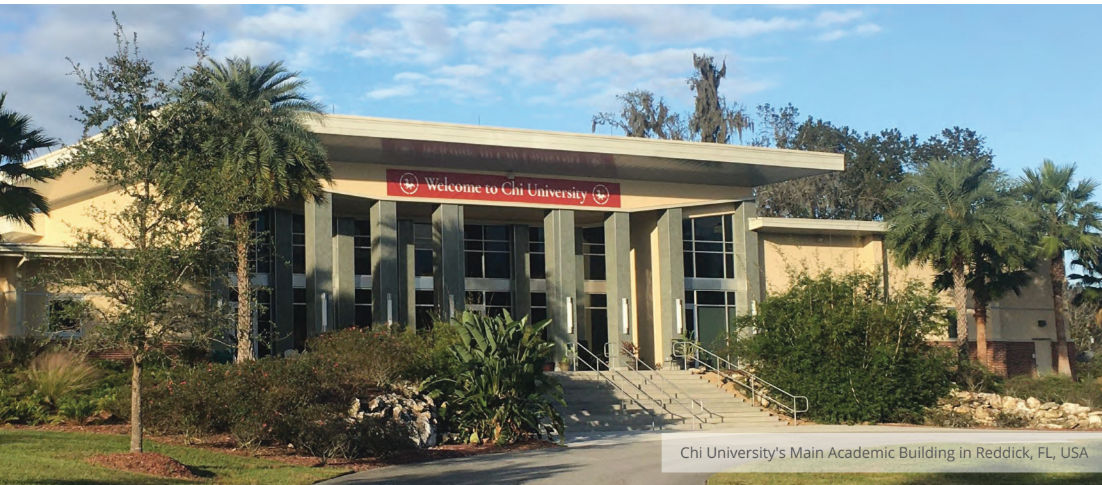
Chi University's Main Academic Building in Reddick, FL, USA