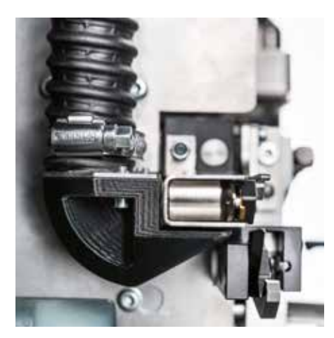
Optional suction unit for stripping remnants