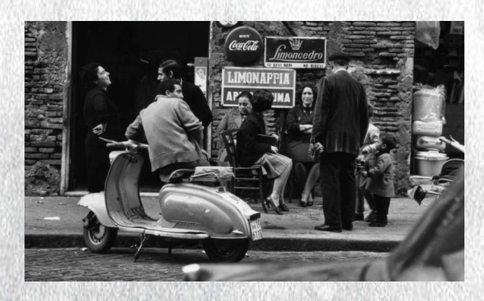
*Subject to availability

Mushroom & sherry / black pepper & brandy / garlic butter / 35 gorgonzola / madagascan green peppercorn sauce All sauces made fresh with cream