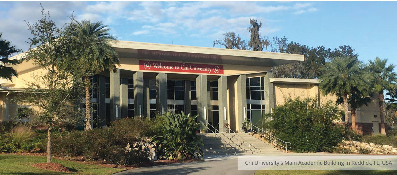
Chi University's Main Academic Building in Reddick, FL, USA