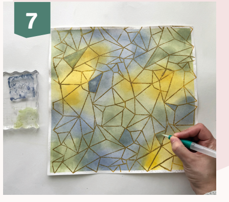
Use a filled water brush to pick up the ink and colour random sections of the stamped pattern.