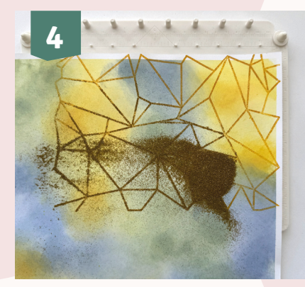
Immediately after stamping, sprinkle gold glitter embossing powder over the still wet ink. Work quickly, as the powder won't adhere once the ink is dry.