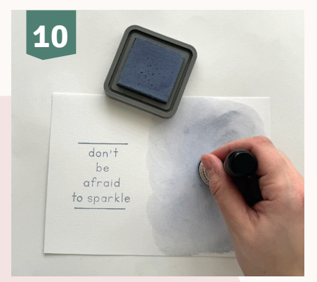
Spray water on the other half of the paper and apply ink in a swirling motion.