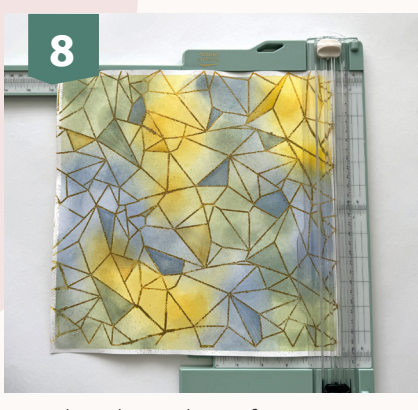
Trim the white edges of your paper and then cut it to a size of 29.5 x 29.5 cm.