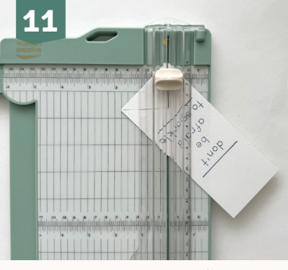
Now, cut two banners, one from the blended paper and one from the stamped paper. Adhere them together with foam tape and then onto the larger cardstock sheet.