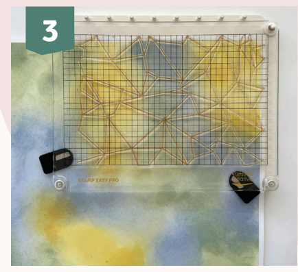
Use one of the Distress colours to stamp the graphic pattern onto the cardstock.