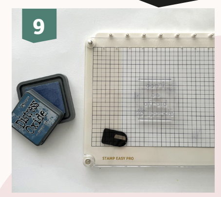
Take another sheet of white cardstock and stamp a text onto it.