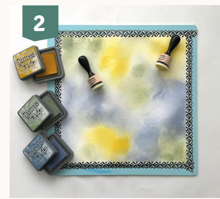
Apply 2 or 3 colours of Distress Oxide ink using an ink applicator. Let the colours blend by applying them in a swirling motion, then allow them to dry thoroughly.