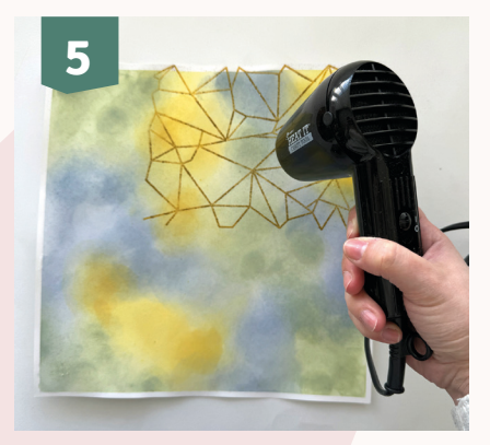
Use a heat tool to set the embossing powder.