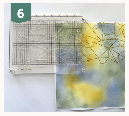
Rotate the stamp and the cardstock so that the pattern aligns again. Repeat steps 3 to 5 until the entire sheet is covered with the graphic pattern.