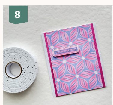
Finally, assemble all the components to create a beautiful card. Attach the text using 3D foam tape for added depth.