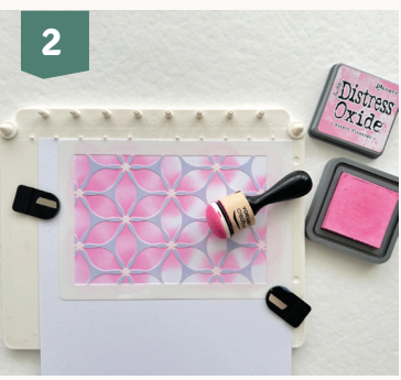
Take the second stencil and place it directly over the ink applied earlier. Opt for a different ink colour for the second layer. Start blending from the middle of the flowers using the blending tool to create a gradient effect.