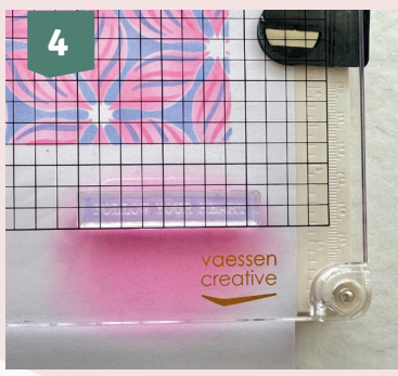
Use one ink colour to create a blended spot on the sheet where stencilling was done. Stamp a text on it using the other colour.