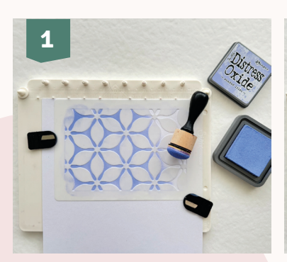
Place a sheet of A4-sized white watercolour paper on a work mat or stamping platform. Position the first stencil on top and apply ink using a blending tool.

Making your own cards is a creative journey! Layer by layer, you build up this card. Use a 'layered stencils' set and choose two ink colours of your liking to create a beautiful pattern. Add a lovely quote to complete the card.