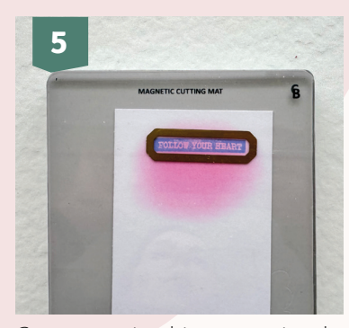
Cut out or trim this text, optionally using an embossing machine.