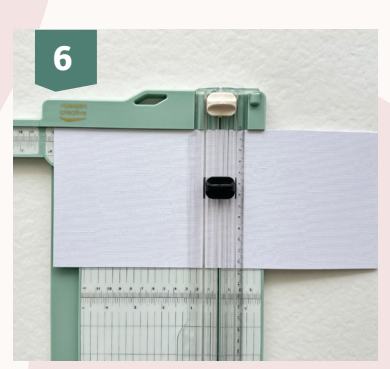
Cut a sheet of white cardstock to 12.5 x 29.7 cm and score it in the middle at 14.8 cm.