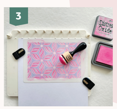
Next, lay stencil number three on the work surface and apply the first ink colour again. Repeat this process with stencil number four, using the colour from step 2.