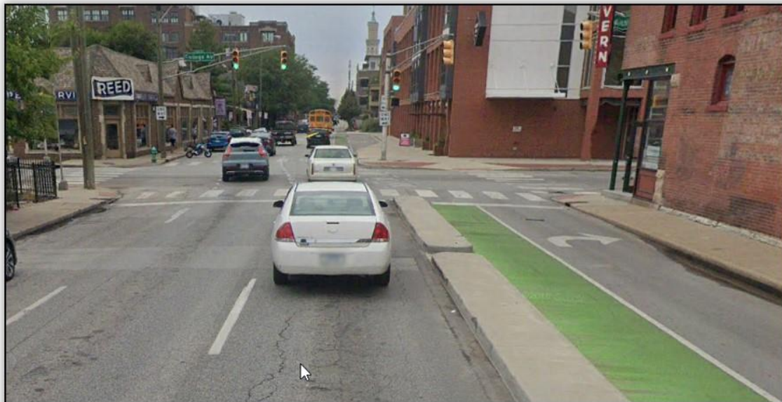
Bike Lane on Michigan St