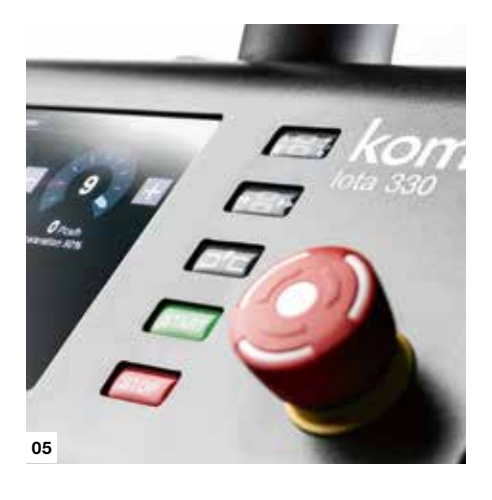
05 The five hard keys from top to bottom: Open and close belt drive Manual feeder Zero-cut Start production Stop production

The lota 330 is ready for use after pressing the 'Power On' button. The material to be cut is clamped in place according to the closing distance and applied pressure settings of the belt drive. The product length, number of pieces and batch size can be set via the touchscreen. The desired end product can be verified using the sample function, and the machine can then be started. Five buttons serving as hard keys for the most common operations, along with the touch display, enable simple handling and quick changeover for a wide range of materials without the use of any tools.