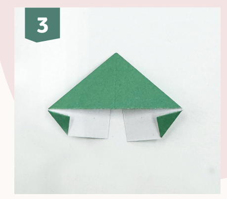
First, fold the diagonals from the centre backwards to create a hat-like shape. Then, fold the small triangles at the bottom forwards.

After die-cutting, you will have strips like these. You can fold the strips immediately.