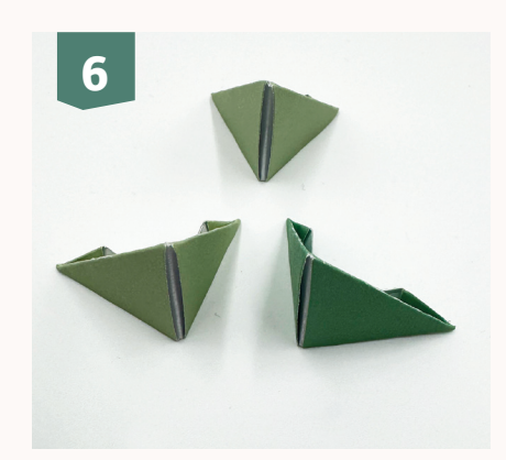
These triangles are the building blocks for the project. Start with two triangles of the same colour and one of a different colour. First, decide on the colour order. (In this case, it goes from light green to dark green, followed by orange to light yellow).