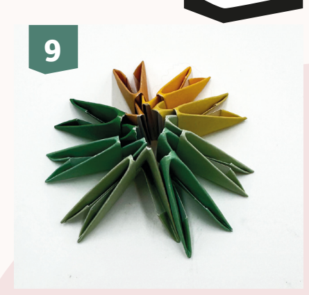
Repeat these steps until all the colours have been used once. Then, continue with the first colour.

Next, take the same colour and slide it over the previous protruding triangle. Then, slide a new colour into the back.