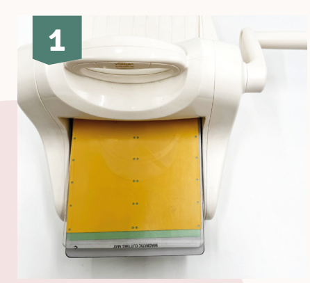
Take the paper pad and cutting die. Cut the paper to size for the die-cutting machine. Then, die-cut four sheets of paper from each of the six colours.

Say goodbye to scattered pens and pencils! With this DIY project, you can create a colourful pen holder from paper. The folding and assembling of the pieces are also very soothing. So, stretch your fingers and get ready to make this eye-catching addition to your desk!