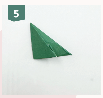
Fold everything in half with the flaps inside. Repeat these steps for all the paper strips until you have all the triangles.