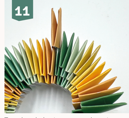
Turn the whole piece over and continue building in the same way. Offset the colours by half a triangle each time to create a spiral effect.