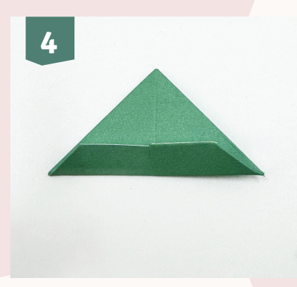
Fold the flaps with the small folded triangles upwards towards the centre.