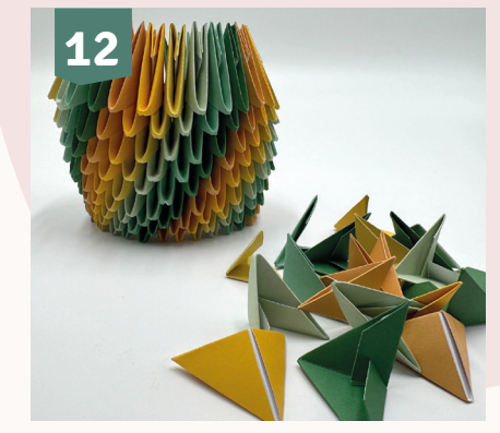
Continue building until you reach the desired height. The higher you build, the more it will take the shape of a container or pot. In this example, it is 11 rings high. Optionally, glue a circle of paper to the bottom if you want to close the pot.