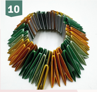
Keep repeating this until all the colours have been used five times and connect them with a final triangle.