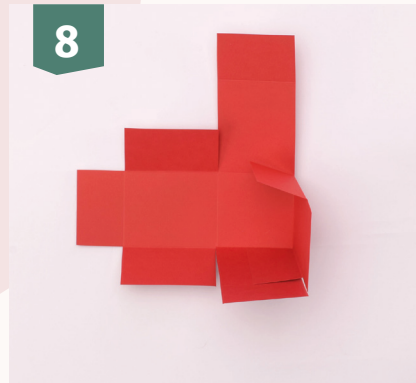
8 Assemble the lid by folding all the flaps inward and sticking them in place.