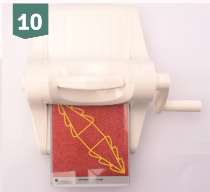
10 Use the die to cut out a Christmas tree box from glitter paper. Repeat to create two shapes.