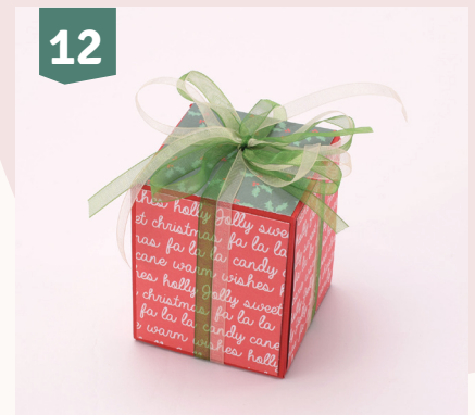
12 Cut two white and two green organza ribbons, each 60 cm long. Tip: stick them criss-cross at the bottom of the box with a small piece of double-sided tape. Then, tie a bow at the top of the box.