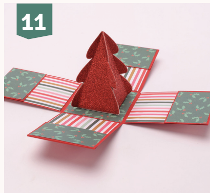
11 Cross the two Christmas tree shapes over each other and glue the sides together. Then, attach the tree to the base of the box.