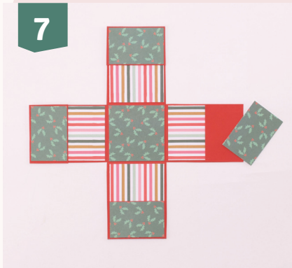
7 Glue the holly paper rectangles onto the storage pockets. In the centre, attach the 5.6 x 5.6 cm square.