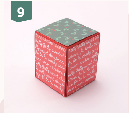
9 Attach the text rectangles and the holly square (6.2 x 6.2 cm) to the outside of the lid.