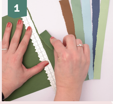
and select your desired colours. Use a tearing ruler to tear strips approximately 2.5 to 3 cm wide.

Explore this DIY to learn how to effortlessly create sleek and stylish strips with torn paper and coloured linen cardstock. Using a tearing ruler, you can give your cardstock a decorative edge, perfect for a variety of creative projects like a card or frame.