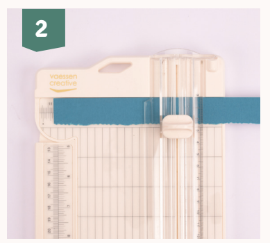
Grab a pack of A4 linen cardstock Cut the strips in half to a length of Cut a sheet of black linen cards-10.5 cm.