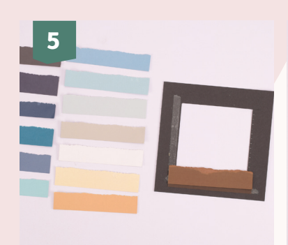
Choose a colour sequence for the strips and start adhering them from the bottom, overlapping like roof tiles.