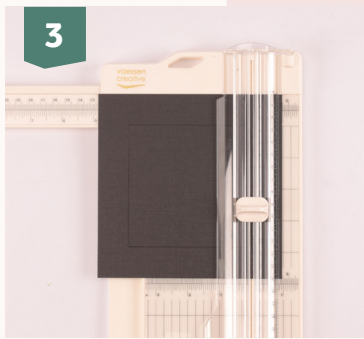
tock to 13.8 x 1.8 cm. Create a passe-partout by placing the paper in the cutter at 2.5 cm and cutting 2.5 cm from the edge each time. Remove the cut-out square from the center.