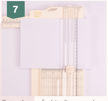
Cut a sheet of white linen cardstock to 14.8 x 14.8 cm and affix the cut-out piece on top. Now you can either make it into a frame or craft a card from it.