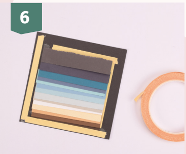
Continue until all strips are attached. Add double-sided tape to the other two sides and then add more tape all around to attach it to another piece of paper or cardboard.